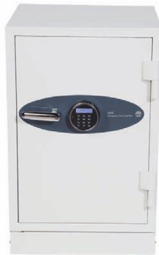
Fire Fighter FS0432E