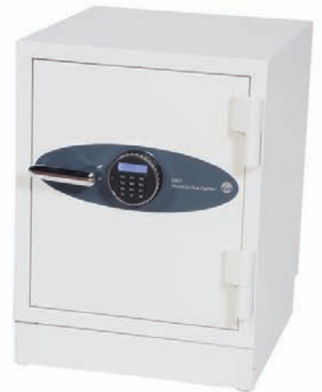
Fire Fighter FS0431E