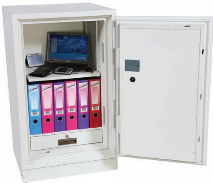
Fire Fighter FS0433E